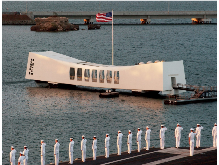
Junior ROTC posting the Colors