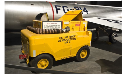
MA-1A Starter Cart

The Starter Cart contains a GTC (Gas Turbine) engine, which drives enough high-pressure air through one of an aircraft's engines to get it started. The GTC-driven air pressure rotates the jet's engine to the required 1640