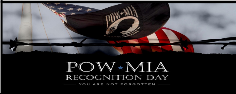
POW/MIA Recognition Day - September 16th