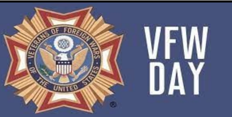
Veterans of Foreign Wars Day - September 29th