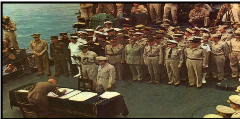
Official Japanese Surrender - September 2nd