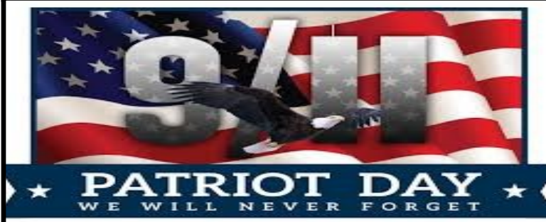
Patriot Day - September 11th