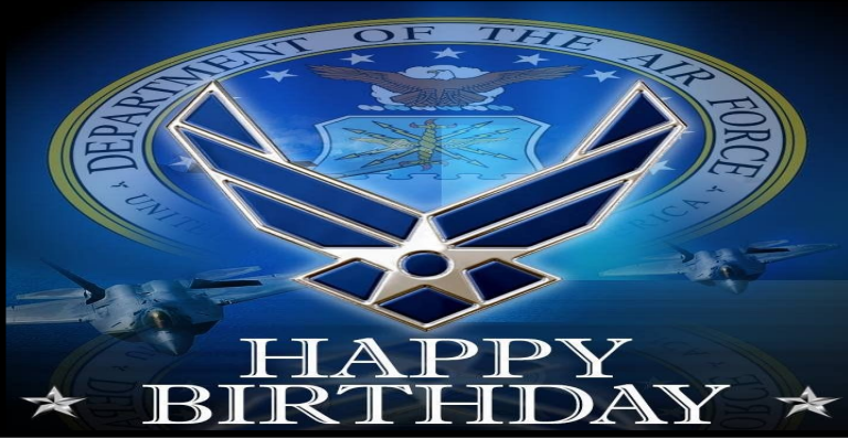
US Air Force Birthday - September 18th