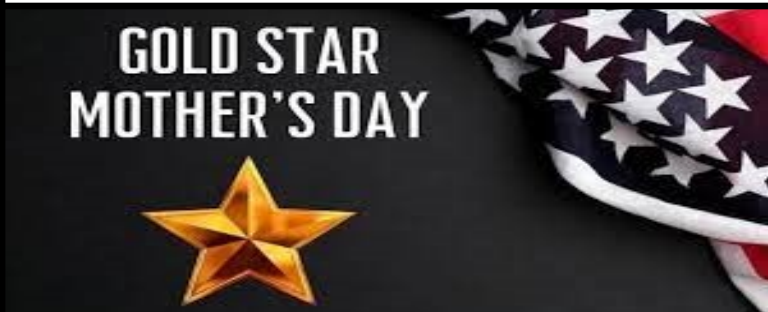
Gold Star Mothers Day - September 25th