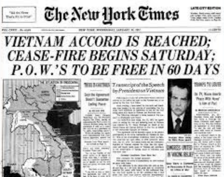
Vietnam War Ceasefire - January 27th