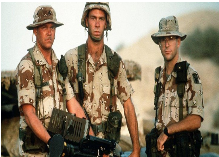
Operation Desert Storm - January 16th