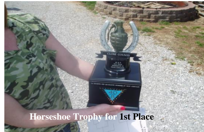
Horseshoe Trophy for 1st Place