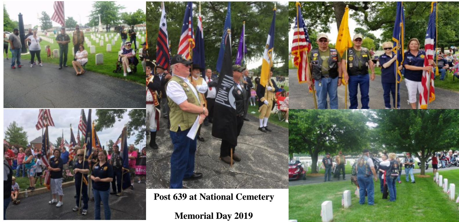
Post 639 at National Cemetery Memorial Day 2019