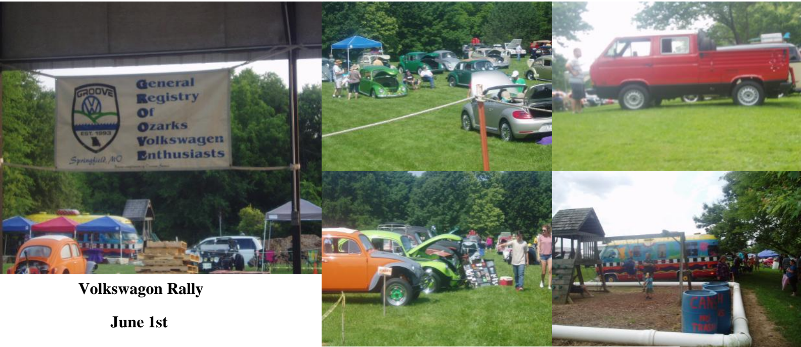
Volkswagon Rally June 1st